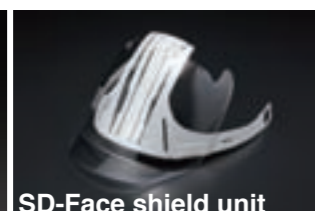
SD-Face shield unit