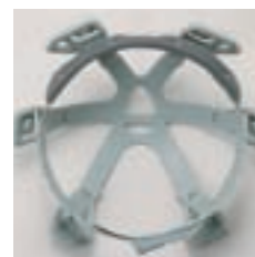
Type 140E For ST#140-EZK,E