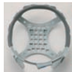
Type N For Bump cap