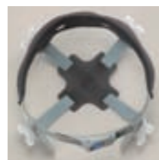
Type C For ST#162-SD