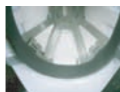
Sweat band for "EPA" buckle