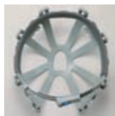
Type E(E3) For ST#0141,148,161