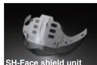
SH-Face shield unit