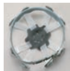
Type A For Big size model