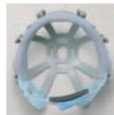
Type EPC For ST#198-EPC