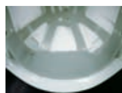
Sweat band for standard buckle