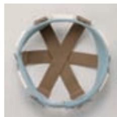
Type H For ST#118-HM