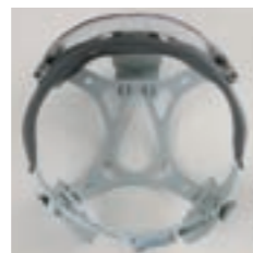
Type 143 SH For ST#143-SH

Even if "EPA" is not standard equipment, it is possible to changed EPA by the optional. (Without Type A and Type H)