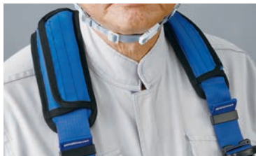
Pad for shoulder strap ST#581 (2 pcs / set)