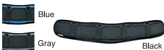
Pad for tool belt ST#589 II