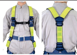
Reflector for full body harness ST#582 (4 pcs / set)