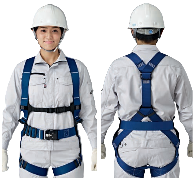
Standard & small sizes

ST#575A-OTII 1,340g (with tool belt OTII buckle) ST#574A-N 930g (without tool belt)