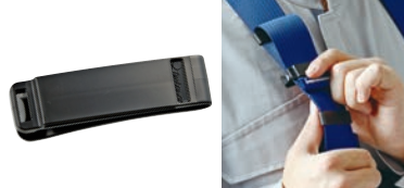
Strap end clip ST#584 •A clip that gathers extra shoulder and thigh straps after adjusting the size. (4 pcs / set)