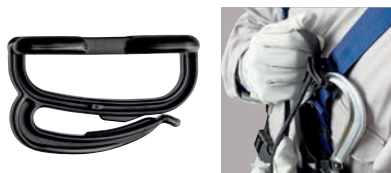
Dual holder ST#583 •Can be used as a resting hook when moving. The hook and the rope can be secured at the same time.