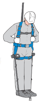
Suspension intolerance strap ST#587 •Secured to the thigh straps in advance. •Ensures normal blood circulation, and prevents compression of blood vessels in the thighs after fall control.