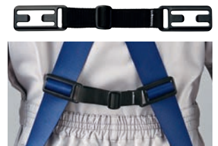
Back strap ST#585 •To be attached when using an X-type harness without a tool belt.