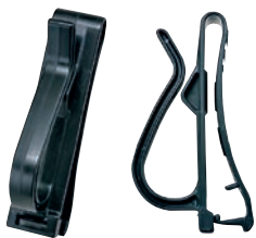
Hook hanger ST#586 •Clip type that can be attached with a single motion.