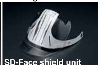
SD-Face shield unit