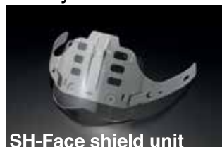
SH-Face shield unit