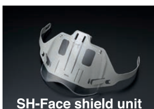
SH-Face shield unit