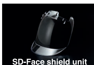
SD-Face shield unit